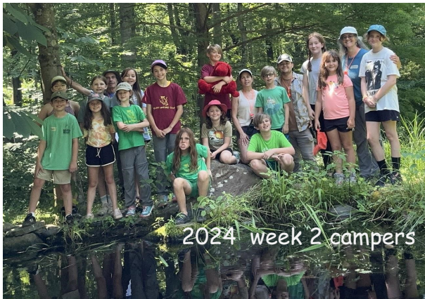
2024 week 2 campers